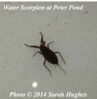
Water Scorpion at Peter Pond