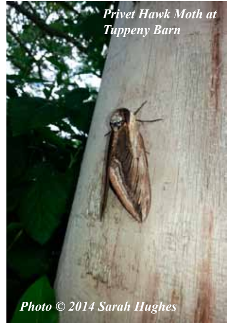
Privet Hawk Moth at Tuppenny Barn

I also helped with Tuppenny Barn's Crowdfunding project by doing the voice-over to their film. It is a revolutionary grand design that is rich in environmental content and contains a blueprint for the way future generations can enjoy healthy and sustainable lifestyles. If successful, the Crowdfunding project will open the doors of the Tuppenny Barn Education Centre to local schools, community groups and the public. It will offer a diverse programme of events and courses designed to stimulate interest in the production of healthy, nutritious food and the promotion of environmentally-friendly practices. Well worth a visit.