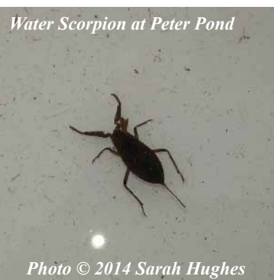
Water Scorpion at Peter Pond