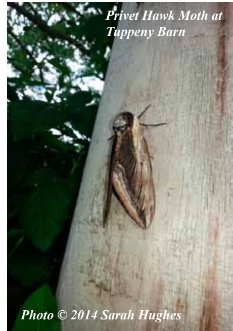
Privet Hawk Moth at Tuppenny Barn

I also helped with Tuppenny Barn's Crowdfunding project by doing the voice-over to their film. It is a revolutionary grand design that is rich in environmental content and contains a blueprint for the way future generations can enjoy healthy and sustainable lifestyles. If successful, the Crowdfunding project will open the doors of the Tuppenny Barn Education Centre to local schools, community groups and the public. It will offer a diverse programme of events and courses designed to stimulate interest in the production of healthy, nutritious food and the promotion of environmentally-friendly practices. Well worth a visit.